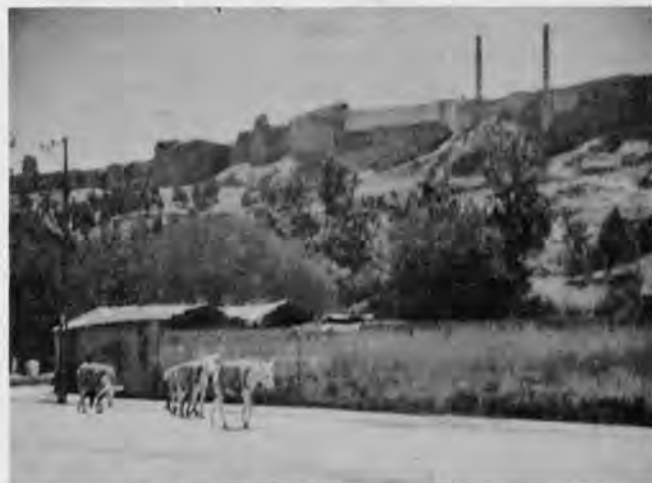
Urfa Wall.

Kurban Höyük—which in Turkish means the mound of sacrifice (but for still unknown reasons)—is a fairly extensive double mound roughly 320 x 210 m in area, ten m in height